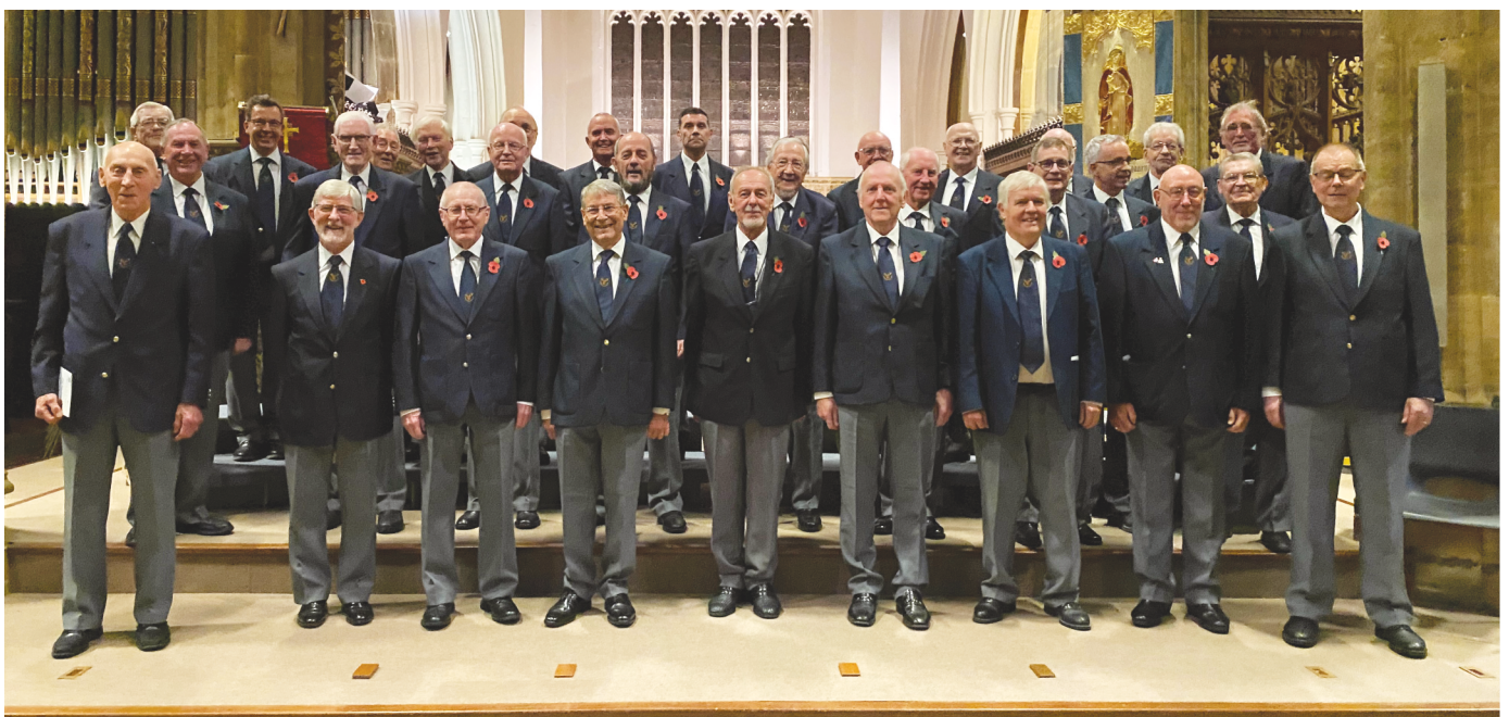
Minehead Male Voice Choir

This was the choir's first major concert since the summer break