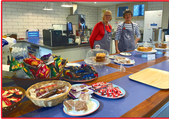
Thanks go to the ladies giving refreshments

Remembrance Sunday and with another concert taking place the same day, we still managed to pull in a large audience of over 120 people.