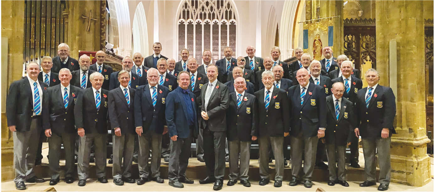
Taunton Deane Male Voice Choir

A truly fabulous concert welcoming Minehead Male Voice Choir to our patch.