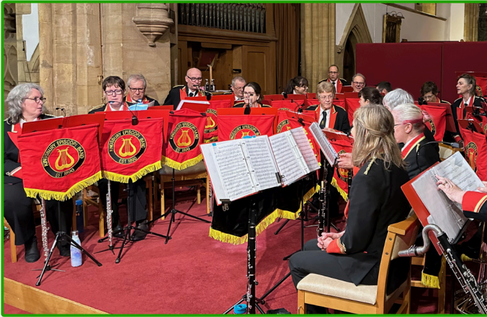
Kingsbury Episcopi Band