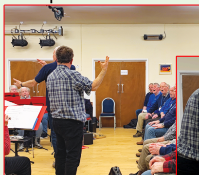
Careful coordination Ruishton Village Hall joint rehearsals