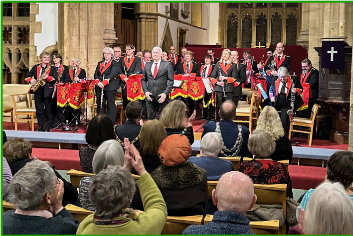
Enthusiastic audience awaits at St James' Church