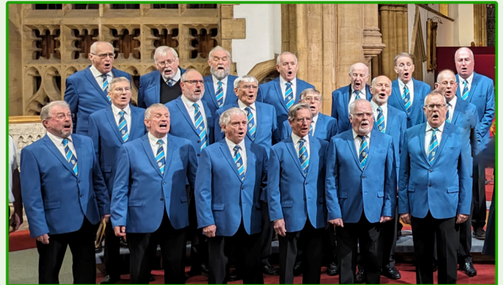
Tenors and Basses