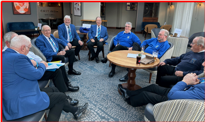
Arrival at Marriott Hotel Northampton

Every now and then, a choir outing unfolds flawlessly: no injuries, no disruptions to bookings, no hotel problems, just smooth transportation in a luxurious coach. The Northampton tour epitomised such a perfect excursion.