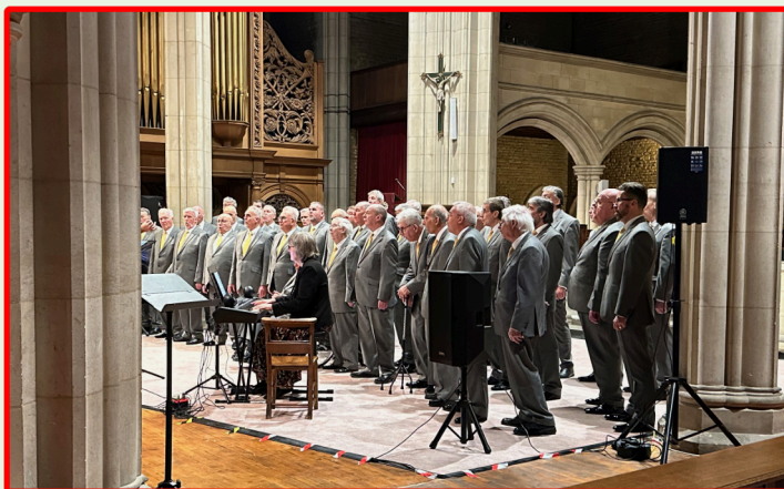
Northampton Male Voice Choir